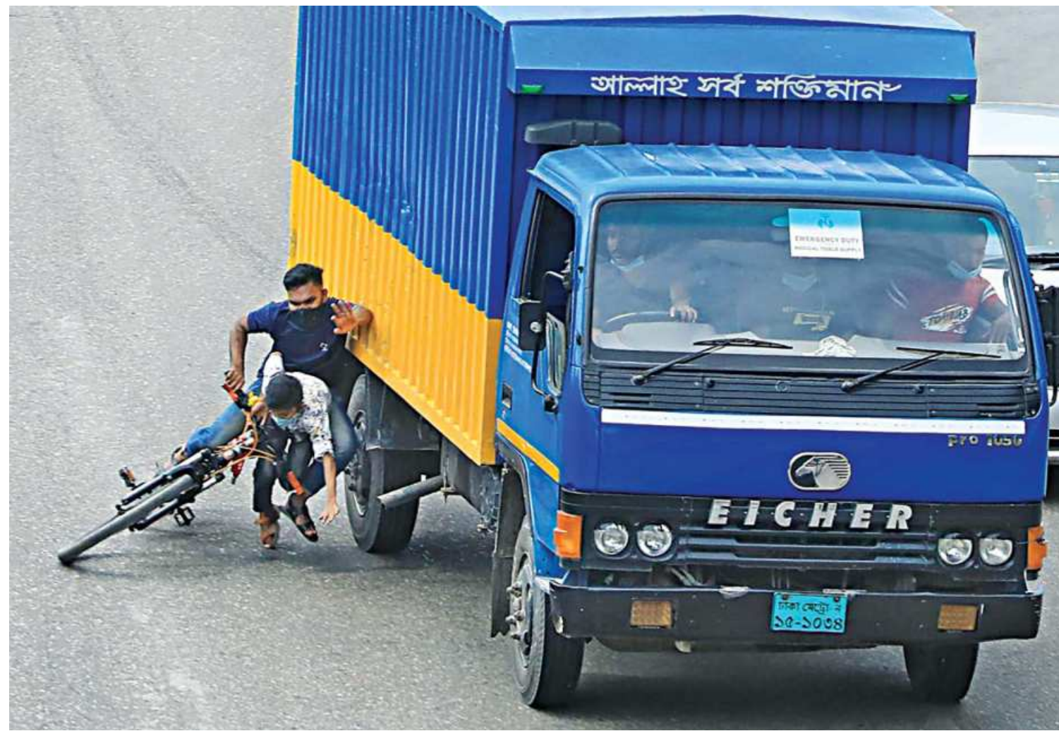
As the streets in the capital are almost empty due to ongoing lockdown, the majority of vehicles are plying without maintaining any traffic rules. The bicycle riders narrowly avoided serious injuries after they crash into a lorry in the city's Banani-Kakoli intersection yesterday.