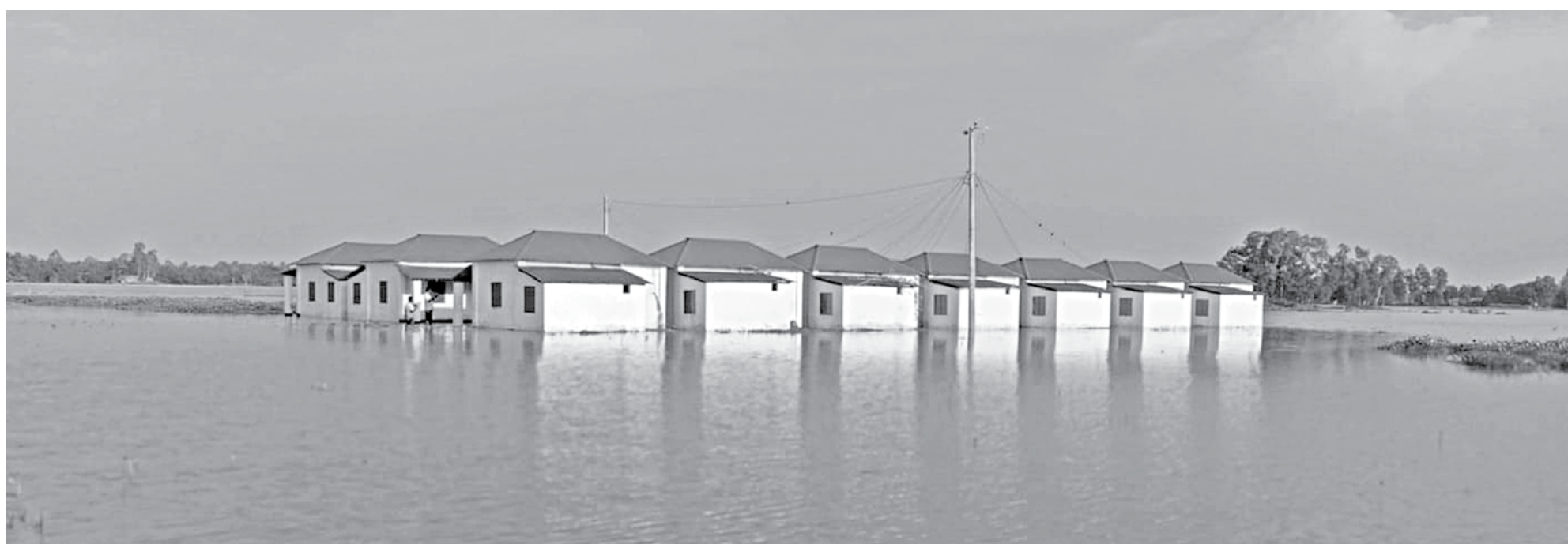
Houses built under the Ashrayan project, through which houses are given to landless and homeless families, in Jamalpur's Sarishabari upazila, were flooded during monsoon rains. Twenty-one families who had received the houses were displaced due to the flooding. The photo was taken on June 23.