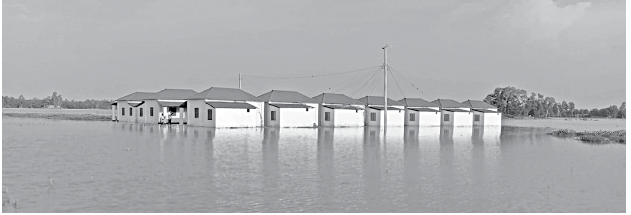
Houses built under the Ashrayan project, through which houses are given to landless and homeless families, in Jamalpur's Sarishabari upazila, were flooded during monsoon rains. Twenty-one families who had received the houses were displaced due to the flooding. The photo was taken on June 23.