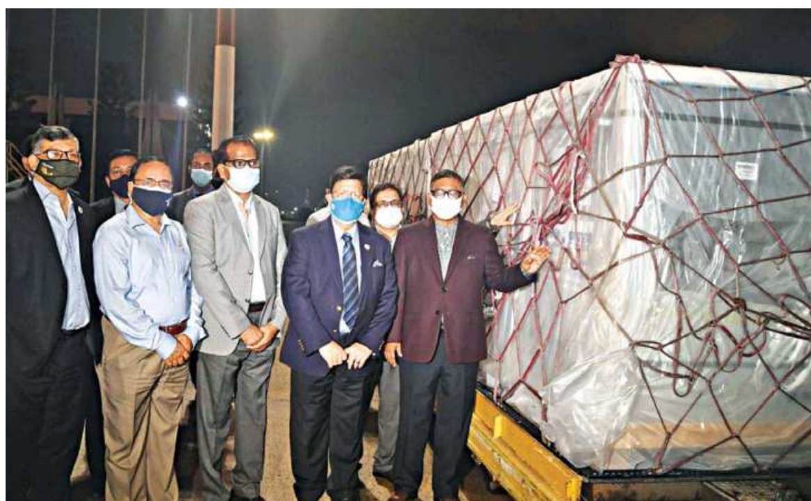
Foreign Minister AK Abdul Momen and Health Minister Zahid Maleque at the Hazrat Shahjalal International Airport in Dhaka after the arrival of the first shipment of coronavirus vaccine bought from China. Story on page 12.

Suspension of the guards was recommended by the committee on June 30.