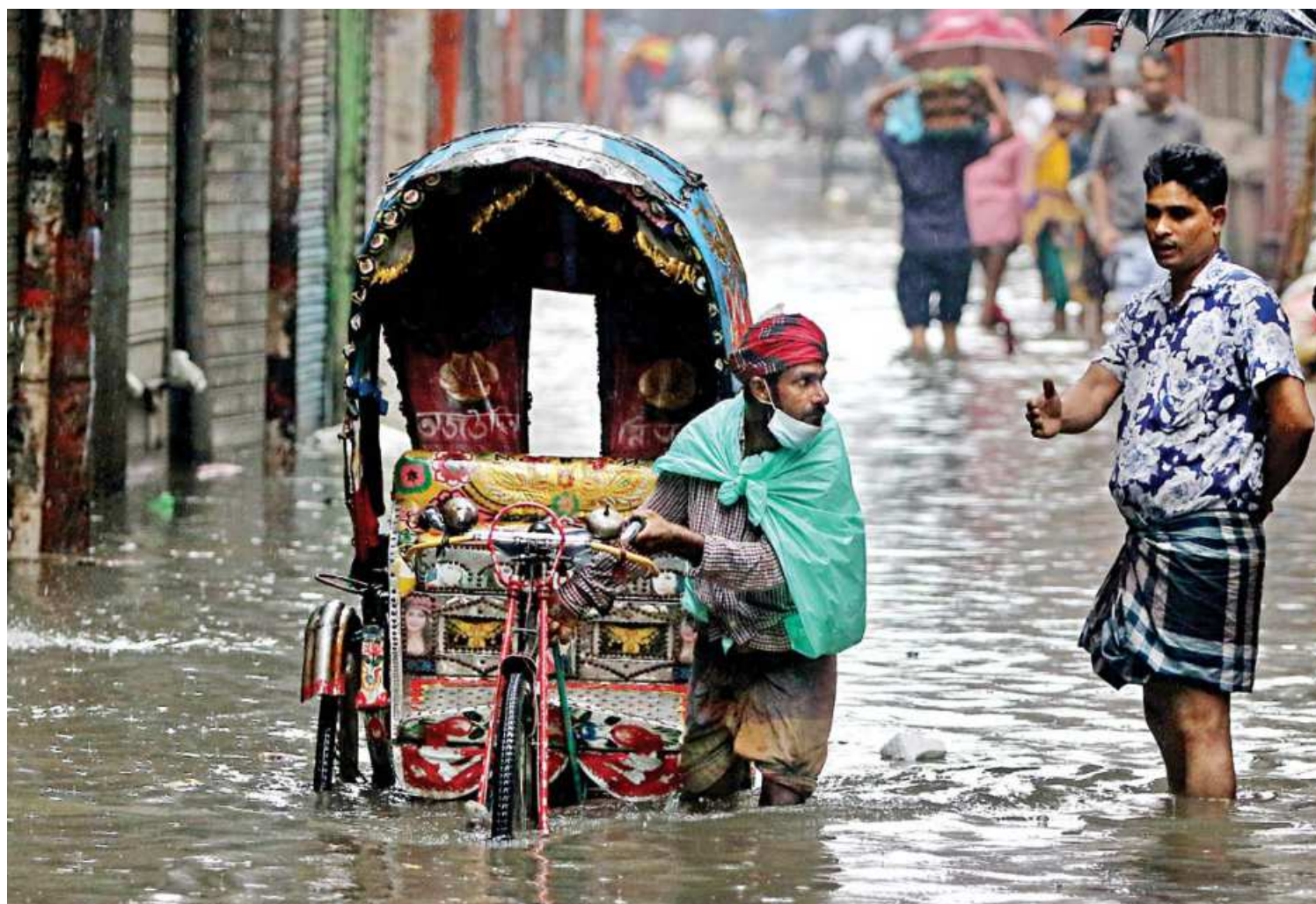
A man pulls his rickshaw through knee-deep rainwater on the waterlogged Haji Osmani Goni Road in the capital's Alubazar. A combination of heavy rain and poor drainage has caused similar hardships to Dhaka residents. The photo was taken yesterday.