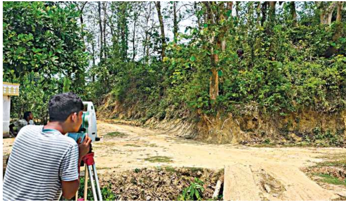
A man operating a surveying instrument as part of the feasibility study and master plan preparation for the country's third safari park at Lathitila forest in Moulvibazar's Juri upazila. The proposed safari park has concerned environmentalists, who think that it will threaten biodiversity in the area. The photo was taken recently.

According to the Forest Sector Master Plan prepared by the Forest Department, natural hill forests occupied 128,630 hectares in 1990, which declined to 79,160 hectares in 2015.