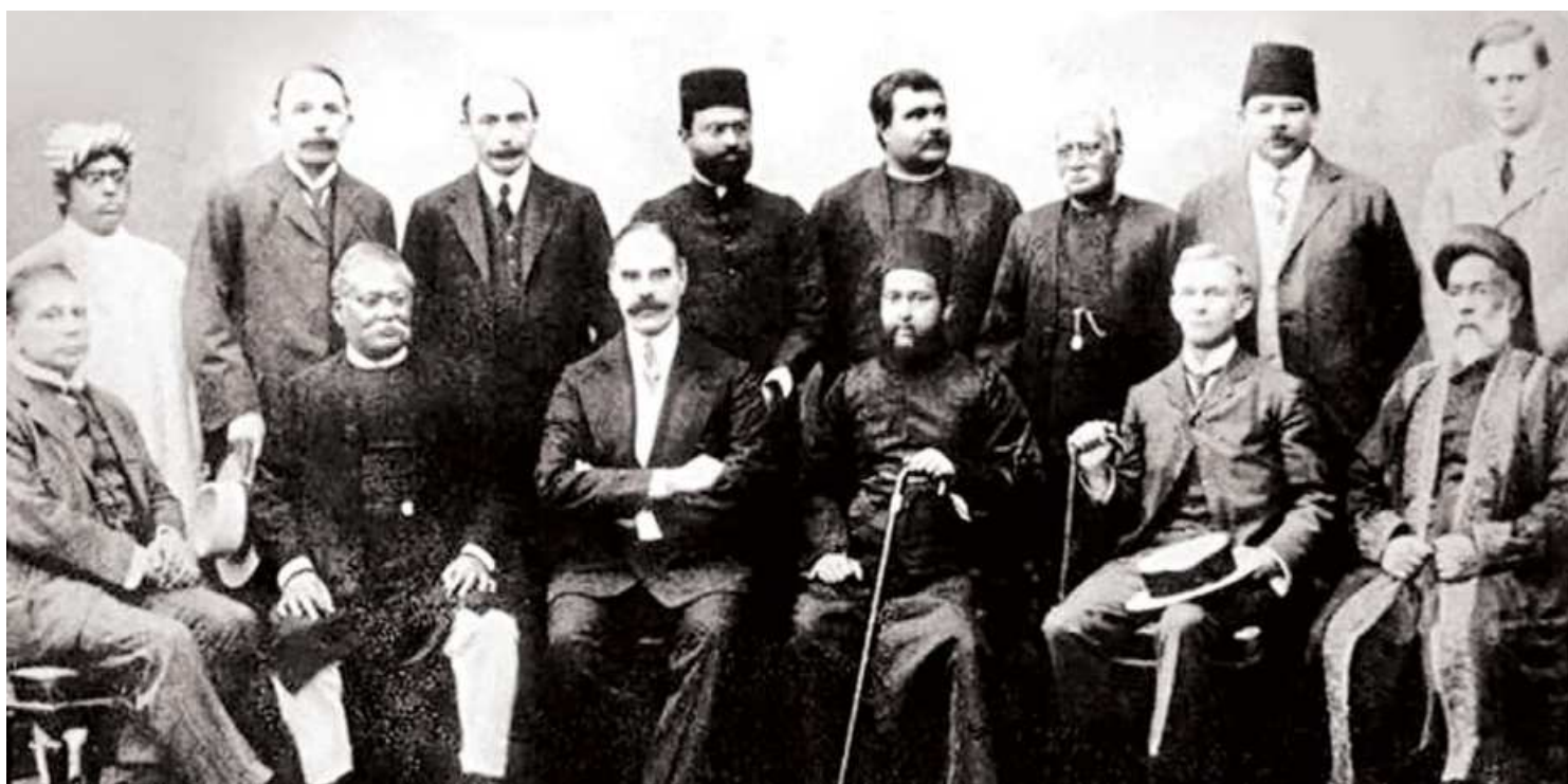
The 1912 Dhaka University Committee.

The author is a master's student of Political Science at Dhaka University, and a freelance journalist. Email: mormeeamhtab23@gmail.com.