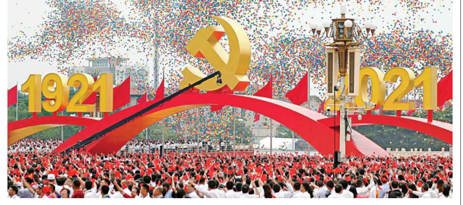
Participants wave national and party flags as balloons are released at the end of the event marking the 100th founding anniversary of the Communist Party of China, on Tiananmen Square in Beijing, yesterday.

The Trump Organization operates hotels, golf courses, and resorts around the world.