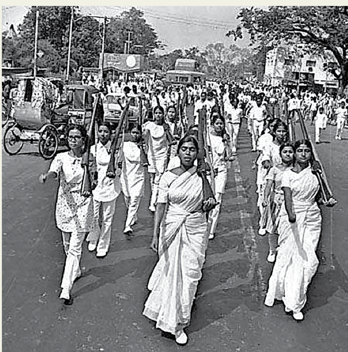
Women marching in the streets of Dhaka. 1971.