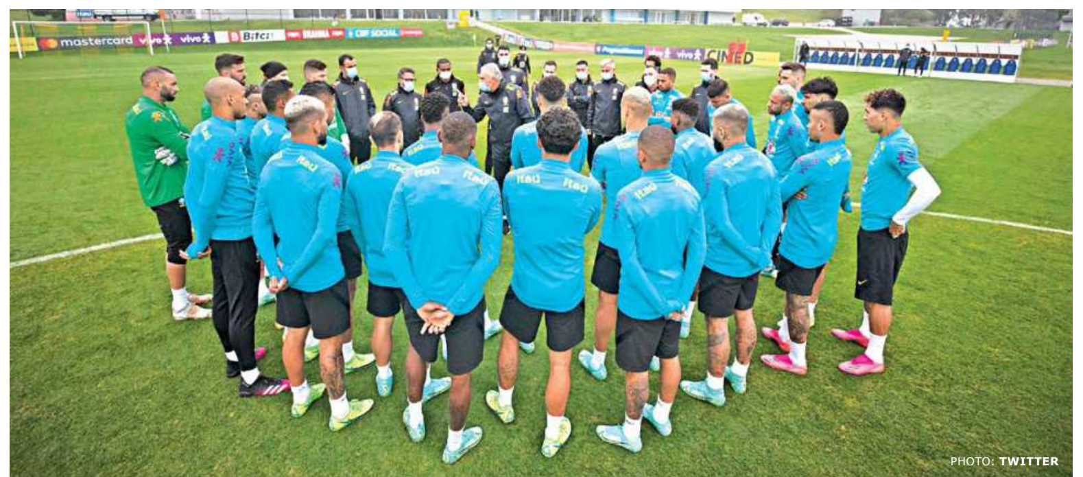
Having topped Group B with three wins and a draw, hosts Brazil will be the overwhelming favourites when they take on Chile in the quarterfinals on Saturday morning (Bangladesh time). The Selecao continued their training for that match at Granja Comary in Rio de Janeiro on Wednesday.

Earlier this month, Zimbabwe Cricket had announced: the series against Bangladesh will be played behind closed doors. The board had also confirmed that the Sports and Recreation Commission of the country has granted permission to host Bangladesh in July despite a surge in Covid-19 cases in the country.