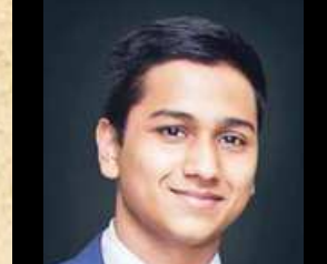
FARAZ AYAAZ HOSSAIN 1996-2016