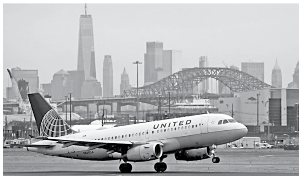
A United Airlines passenger jet takes off with New York City as a backdrop, at Newark Liberty International Airport, New Jersey, US.

After initial gains, Boeing shares ended down 1.8 per cent, resuming losses triggered by delays in certifying the larger 777X. United and Airbus both eased 0.6 per cent.