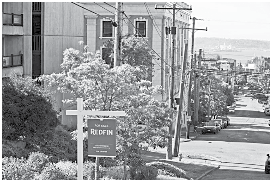
A "For Sale" sign is posted outside a residential home in the Queen Anne neighborhood of Seattle, Washington, US on May 14.

Both new and existing home sales have fallen sharply this year due to a shortage of houses on the market.