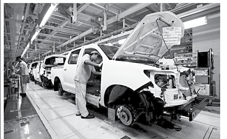
Employees work at an assembly line in the Toyota manufacturing plant located in Chachoengsao province, east of Bangkok.

So far, issues around the global supply of microchips have not yet disrupted Thai auto production significantly, although FTI warns it remains a risk.