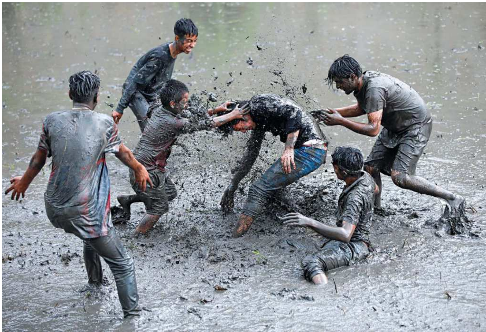
People play in mud as they plant rice samplings on the field during National Paddy Day, also called Asar Pandra, that marks the commencement of monsoon season, in Bhaktapur, Nepal, yesterday.

The items were recovered several months later.