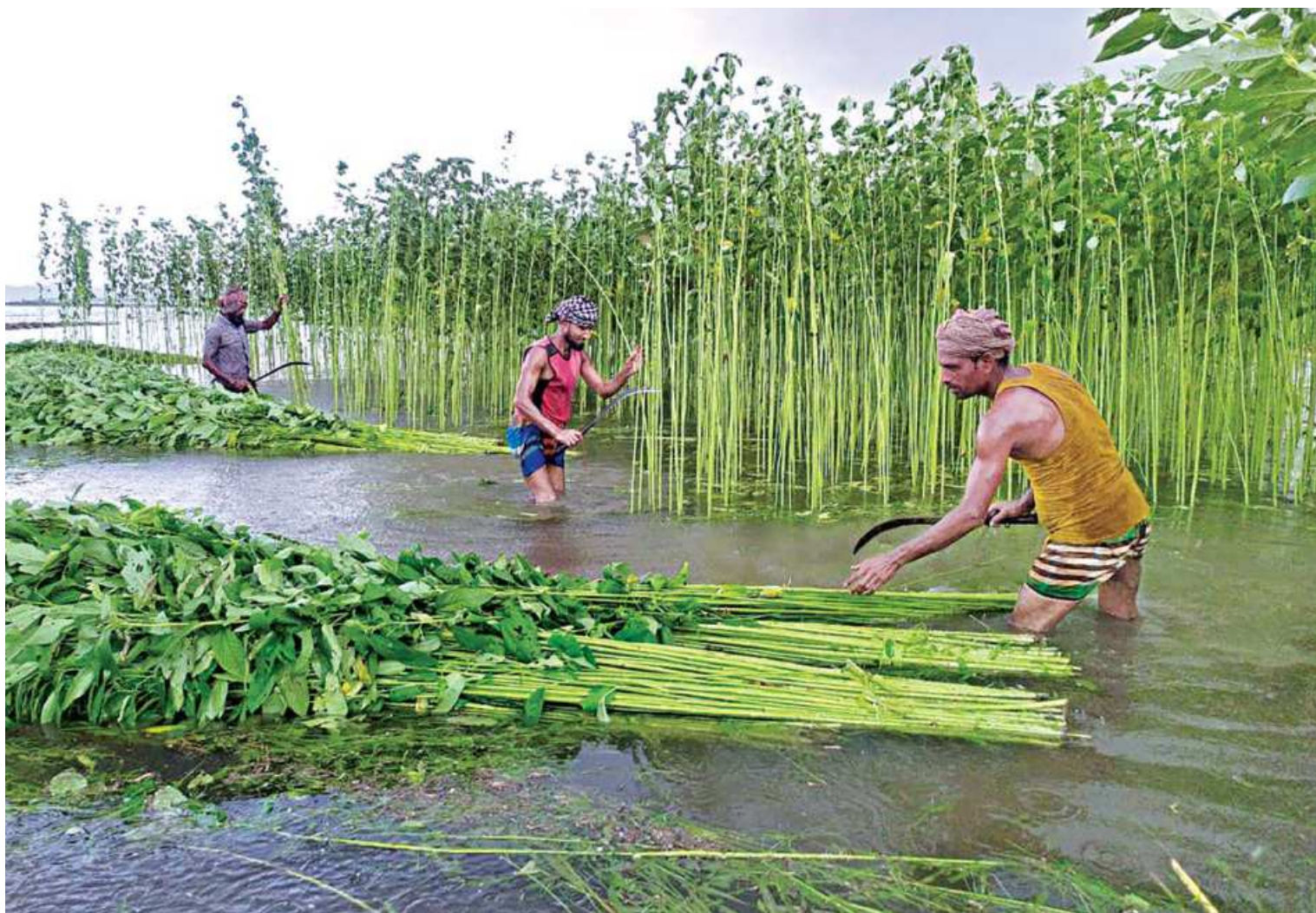
These farmers have opted to harvest their jute plants 15 days in advance after this patch of land was suddenly inundated, an unexpected turn of events that had reduced the country's overall production last year. However, a bumper harvest is expected this year. The photo was taken at Talma village of Nagarkanda upazila of Faridpur recently.