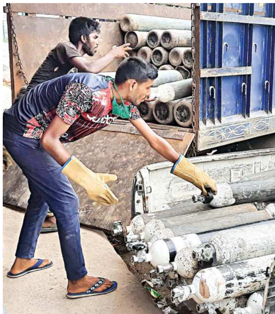
The demand for oxygen is on the rise in Khulna and adjacent districts due to the increasing number of coronavirus cases. The supplying companies have bumped up deliveries at least three folds. The photo was taken on a company ground in Khulna.