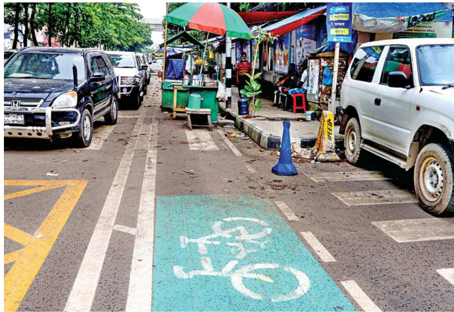
Due to lack of monitoring and public awareness, most of the bicycle lanes in the capital are now used for illegal parking and roadside stalls. In the photo taken in the city's Agargaon area, a food cart is seen on the bike lane while two vehicles are parked on zebra crossings.