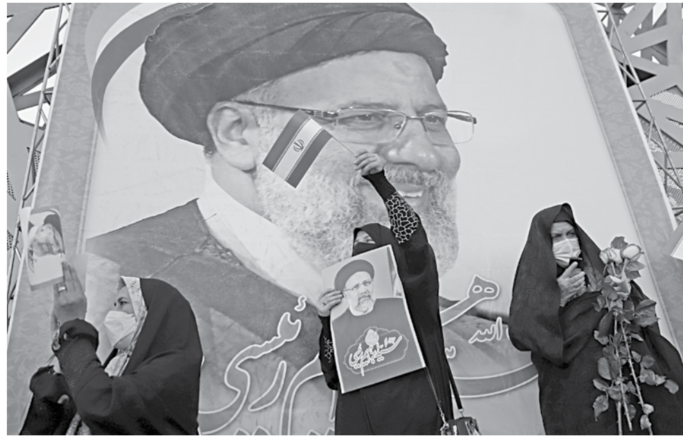
A supporter of Ebrahim Raisi displays his portrait during a celebratory rally for his presidential election victory in Tehran, Iran June 19, 2021.