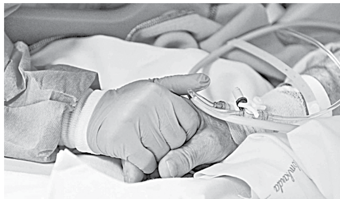
People living with NCDs are at higher risk of severe Covid-19-related illness and death.

By intensifying community outreach and engagement, policymakers can ensure people from all walks of life understand the signs and symptoms of NCDs, and how to get tested and treated.