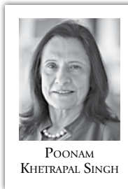
POONAM KHETRAPAL SINGH

Amid the Covid-19 response, opportunities to prevent, detect, control and treat NCDs must be fully harnessed