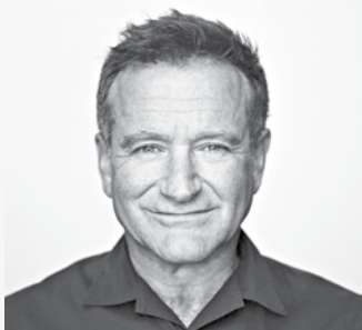
ROBIN WILLIAMS American actor (1951—2014)

No matter what people tell you, words and ideas can change the world.