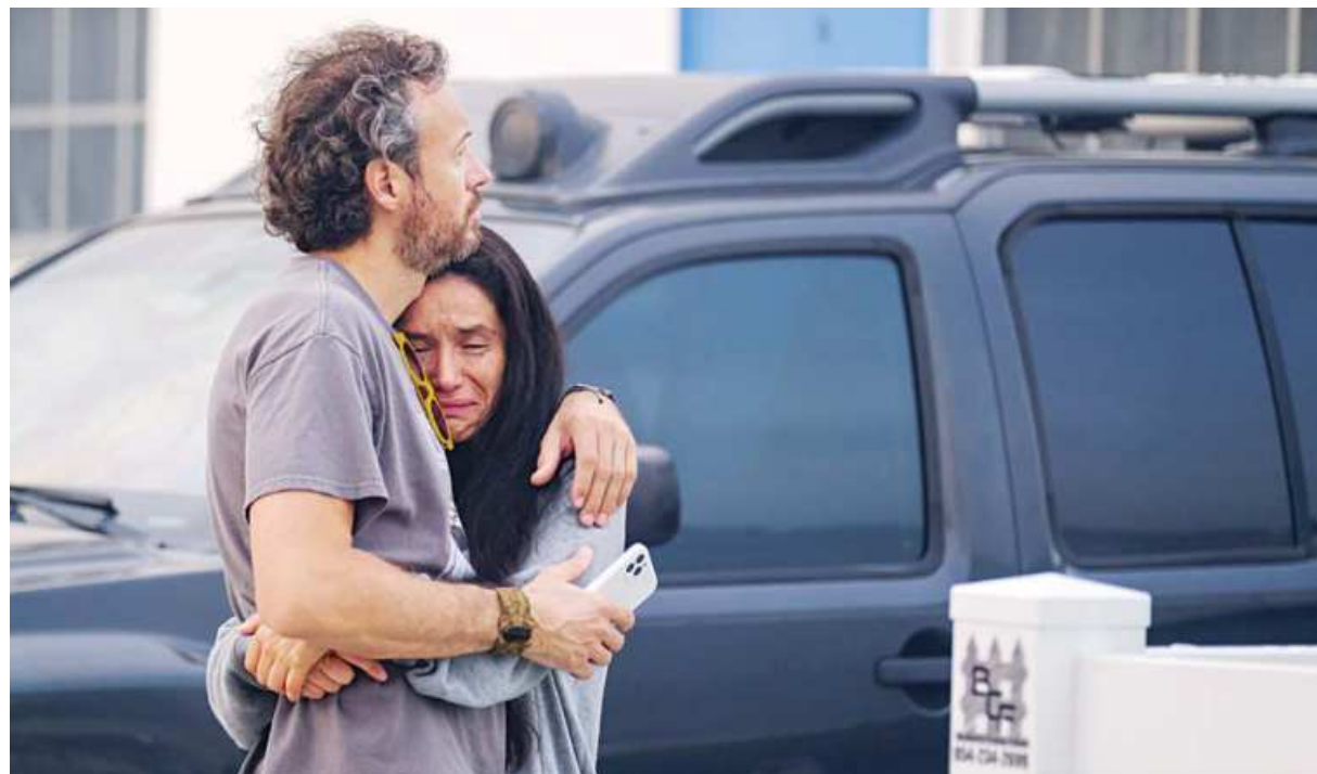
People react at a memorial for victims of a partially collapsed residential building in Surfside, near Miami Beach, Florida, US, on Friday. A large section of the 12-story building collapsed in the early hours of Thursday, in a disaster whose cause is not yet known. Four people have been confirmed killed and 159 are still unaccounted for. A structural field survey report completed nearly three years before the collapse of the building raised concerns about structural damage to the concrete slab below the pool deck and "cracking and spalling" located in the parking garage. The report, however, didn't give any indication that the structure was at risk of collapse.

More than 100,000 years ago, several human species coexisted across Eurasia and Africa, including our own, Neanderthals and Denisovans, a recently discovered sister species to Neanderthals. "Dragon man" might now be added to that list.