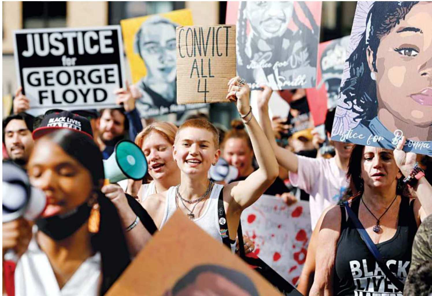
Protesters march during a brief rally after the sentencing of Derek Chauvin, the former Minneapolis policeman found guilty of killing George Floyd, a Black man, in Minneapolis, Minnesota, US, on Friday. Chauvin's 2 and half years sentence was one of the longest given a former police officer for using unlawful deadly force in the United States.