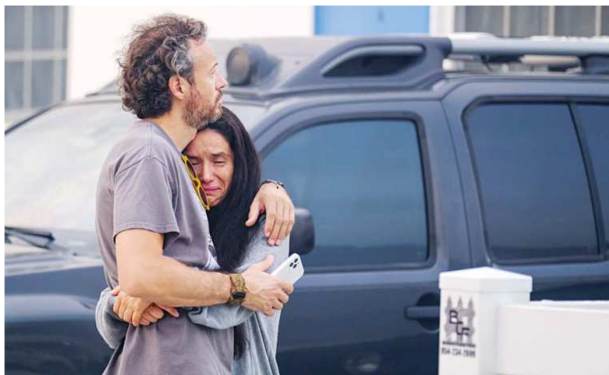
People react at the memorial for victims of a partially collapsed residential building in Surfside, near Miami Beach, Florida, US, on Friday. A large section of the 12-story building collapsed suddenly in the early hours of Thursday as residents slept, in a disaster whose cause is not yet known. Four people have been confirmed killed and 159 are still unaccounted for, with search-and-rescue teams working around the clock through an unstable mountain of debris.

More than 100,000 years ago, several human species coexisted across Eurasia and Africa, including our own, Neanderthals and Denisovans, a recently discovered sister species to Neanderthals. "Dragon man" might now be added to that list.