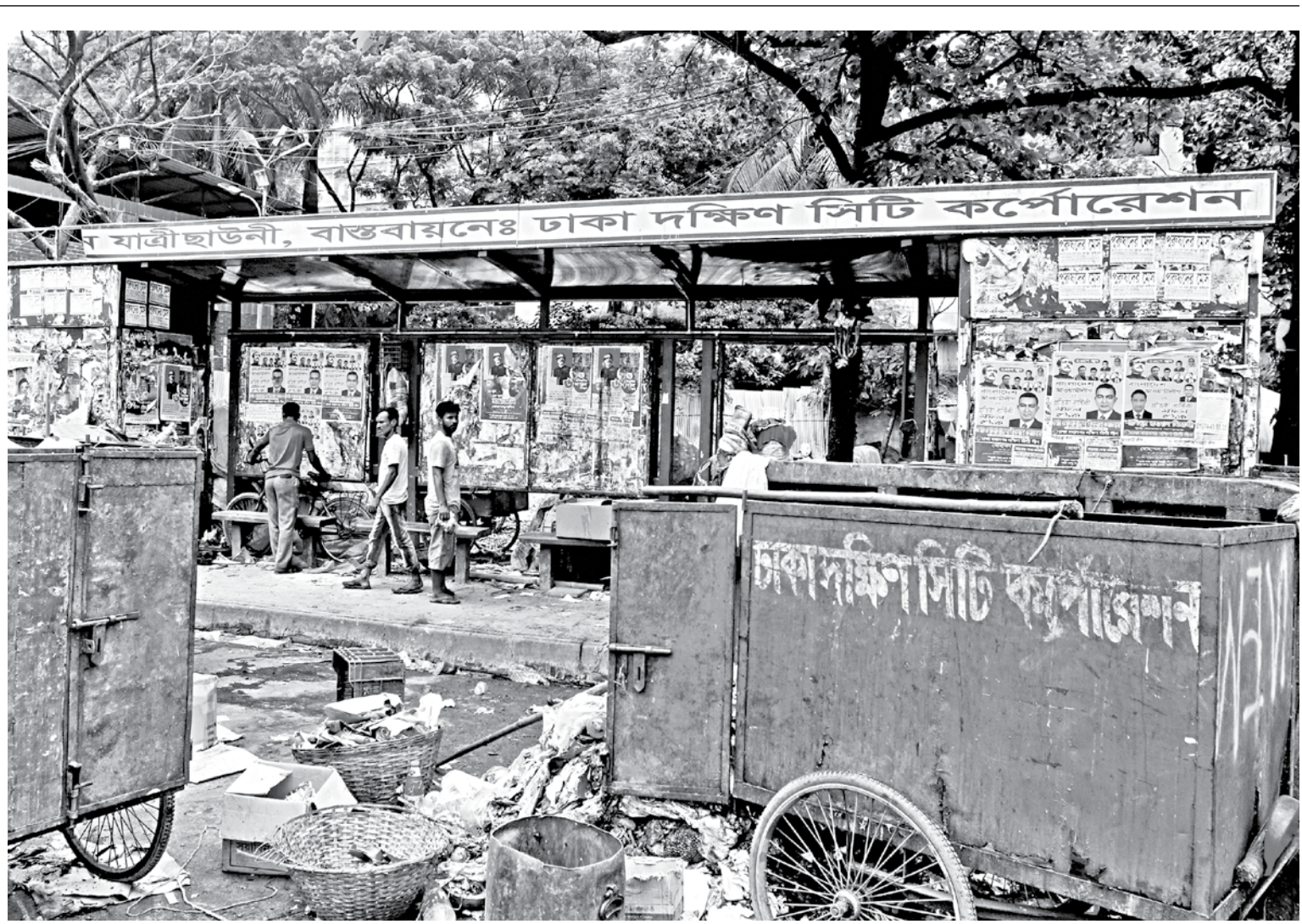
Right down the middle of Purana Paltan and Zero Point in the capital, Dhaka South City Corporation had constructed an environmentally passenger-shed for the people's convenience. However, it has now become a dumping ground for the area's waste, rendering it completely unusable. This photo was taken vesterday.

Superintendent Engineer Dinajpur PWD Circle, Dinajpur Phone: 0531-67034 E-mail: se_dinaj@pwd.gov.bd