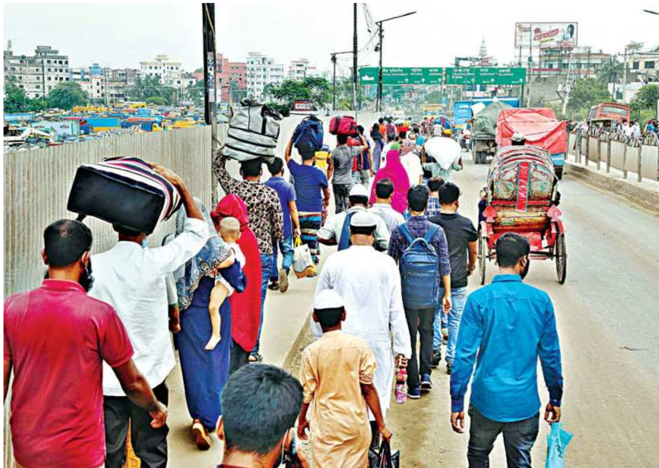
Scores of people, many with businesses and jobs in the capital, have started leaving for their hometowns after hearing that a strict shutdown will be imposed from tomorrow. Since communication with the city is already "cut-off" to prevent the spread of Covid-19, the people in this photo taken yesterday morning are walking to Aminbazar where they will find transport to their hometowns.