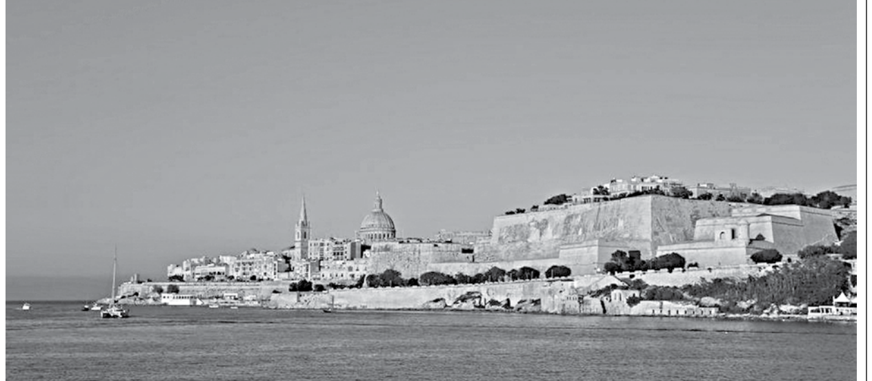
A general view of Valletta, Malta. The Maltese government had already flagged its inclusion on the list, which indicates deficiencies but has no legal repercussions.

The Philippines passed a law in January to strengthen anti-money laundering and terrorist financing regulations.