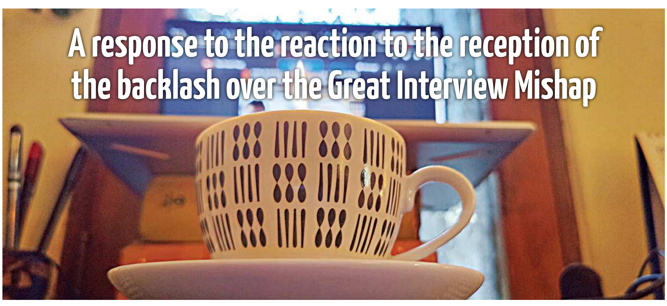
We didn't have time for a cartoon, plus we are already using two and that's the limit. So here's a flame in a teacup, because we don't have the technical knowhow to depict a storm in a teacup.