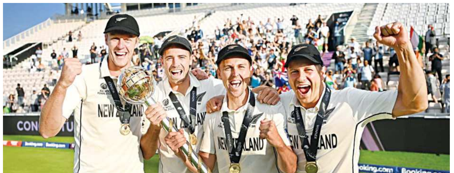
New Zealand's pace quartet-- Kyle Jamieson, Tim Southee, Trent Boult, and Neil Wagner-- was relentless and never let the Indian batsmen settle down in both the innings of the WTC final.