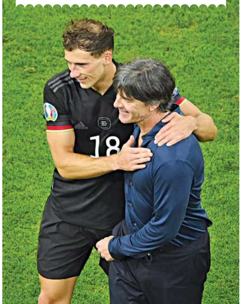
Germany coach Joachim Loew and Leon Goretzka are all smiles after the match as a late Goretzka goal salvaged a 2-2 draw for Germany against Hungary on Wednesday night, in a whip-saw contest that sets the Germans up for Round-16 match against England at Wembley.

***ALL TIMES ARE IN BANGLADESH STANDARD TIMES