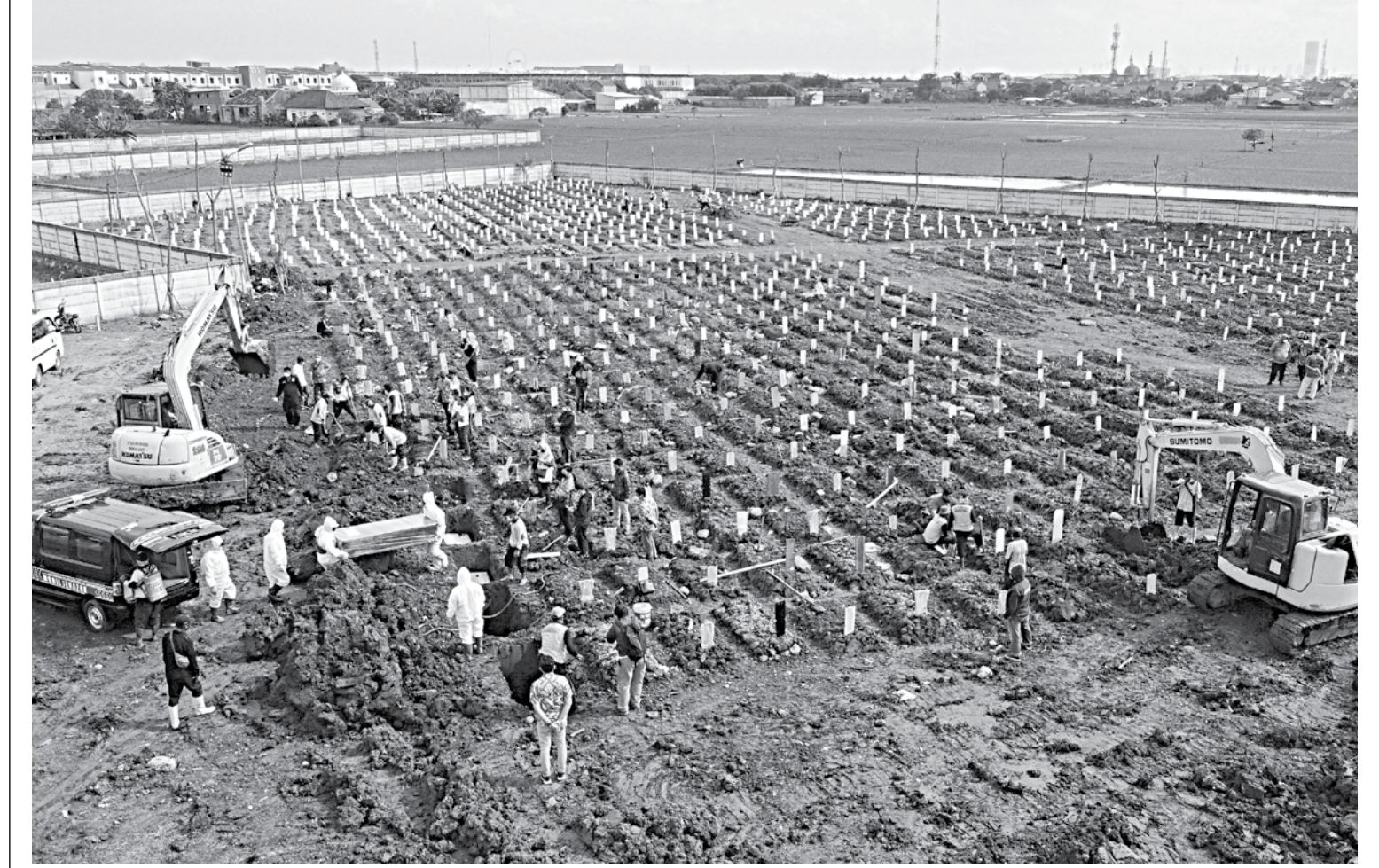
Municipality workers carry a coffin from an ambulance to a designated burial area for victims of the Covid-19 in Jakarta, Indonesia, yesterday. Indonesia recorded its biggest daily increase in coronavirus cases yesterday with 20,574 infections. The data also showed there were 355 new deaths.

Prime Minister Abiy Ahmed sent troops to Tigray in November to oust the dissident regional leadership, promising a swift victory. But nearly eight months later, fighting continues, which has triggered a humanitarian crisis with the UN warning 350,000 people are on the brink of famine.