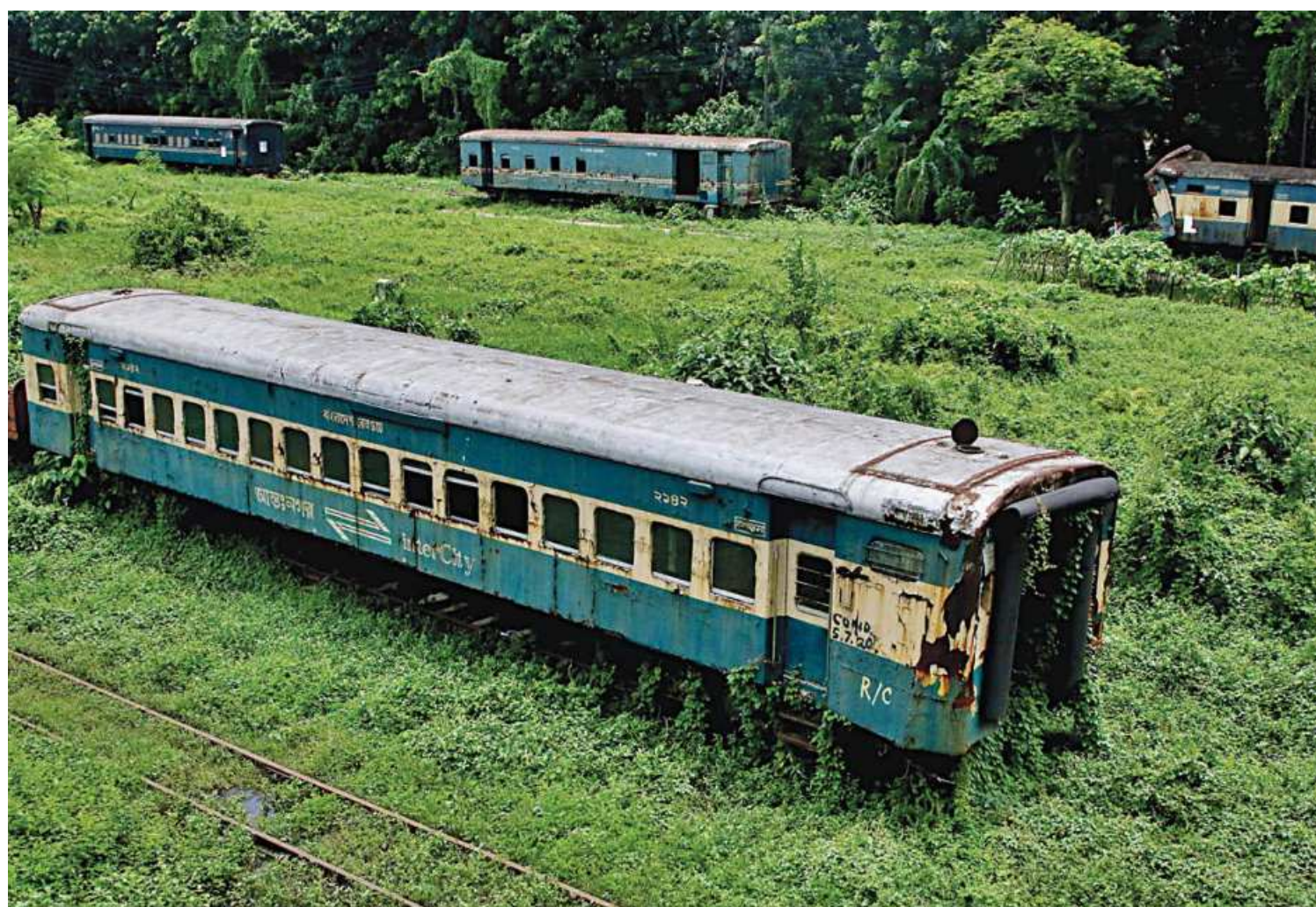
Shrubs and bushes are growing in and around railway carriages left at a workshop of Bangladesh Railway in the capital's Kamalapur area. These carriages were taken there for repairs but they have been left in the open without care. The photo was taken yesterday.