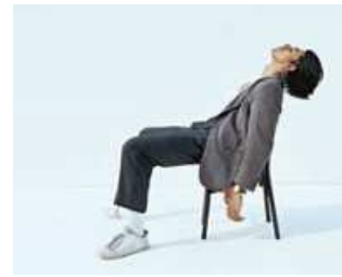
DREAMS OF DAMEER PG 4