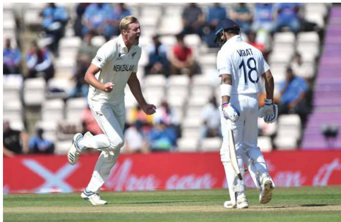
New Zealand pacer Kyle Jamieson celebrates dismissing India skipper Virat Kohli on the final day of the World Test Championship final at the Ageas Bowl in Southampton yesterday. The Kiwis bowled India out for 170 and were chasing a target of 139 runs in 53 overs. New Zealand scored 44-2, needing 95 more runs in 35 overs.