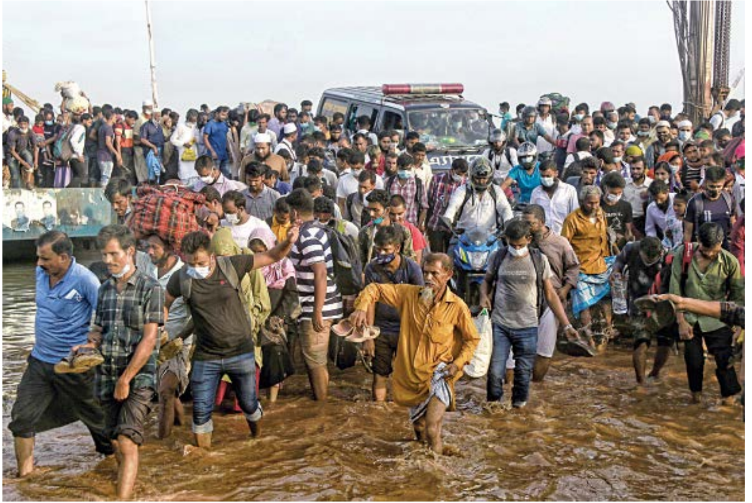
People in their hundreds wade through river water to get off a ferry pontoon and on to the shore at Mawa yesterday. With only a handful of ferries running to cater to emergency vehicles, people heading for Dhaka are cramming onto those ferries to bypass the movement restrictions imposed to curb Covid spread.