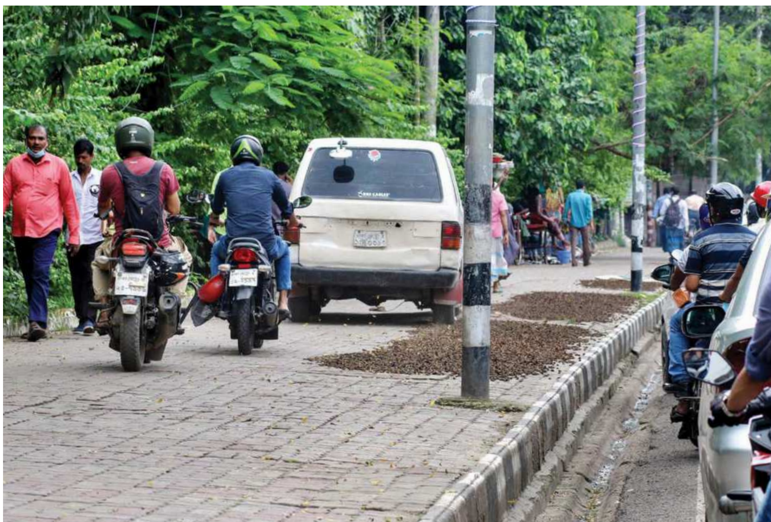
Pedestrians dodge motorbikes and a microbus which got on the pavement to get ahead of the gridlock on Panthapath-Tejgaon Link Road near Sonargaon intersection yesterday. The fish traders across the street are also drying fish waste on the pavement.