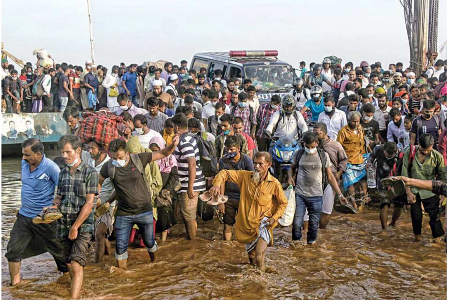
People in their hundreds wade through river water to get off a ferry pontoon and on to the shore at Mawa yesterday. With only a handful of ferries running to cater to emergency vehicles, people heading for Dhaka are cramming onto those ferries to bypass the movement restrictions imposed to curb Covid spread.