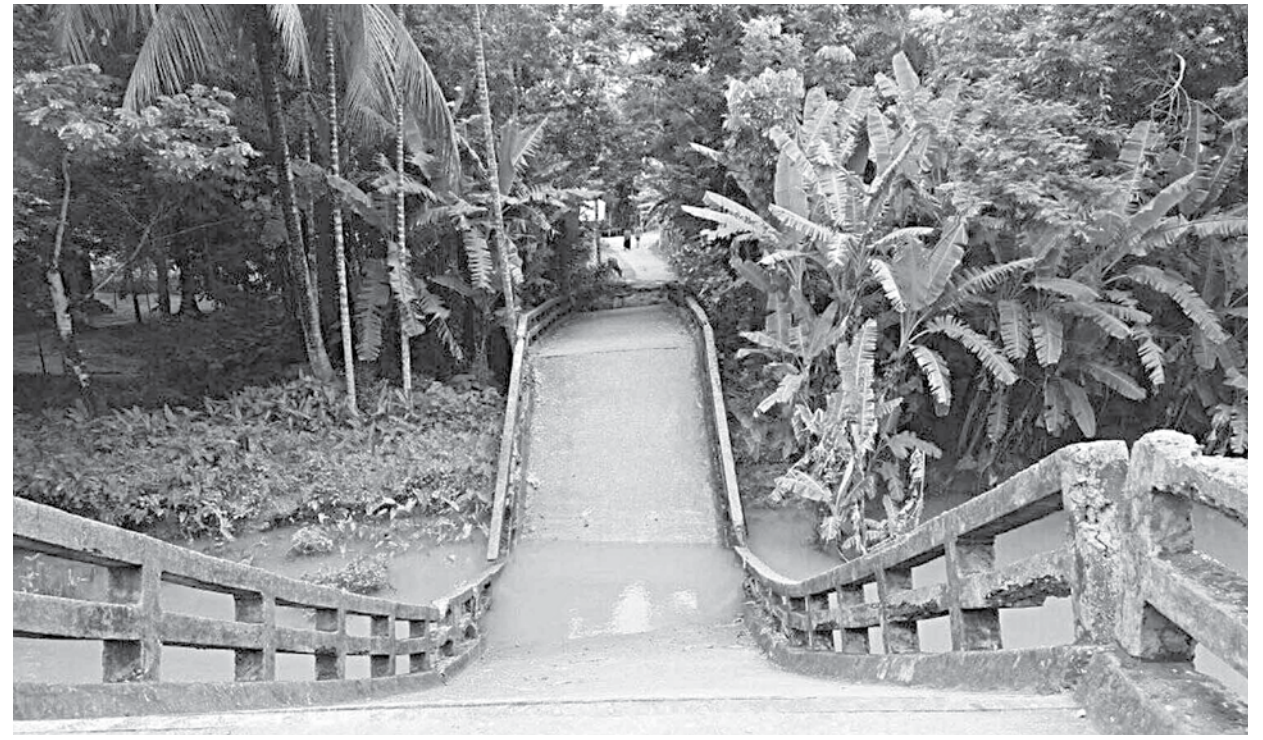
Three of the seven bridges that are in an appalling state in four unions of Barguna's Amtali upazila. Top right, the bridge on Gazipur canal in Atharogachhia union. Top left, the bridge on Chawra canal near Kaunia Ibrahim Academy in Chawra union. Bottom, Loda canal near Hafezia Madrasa in Chawra union.