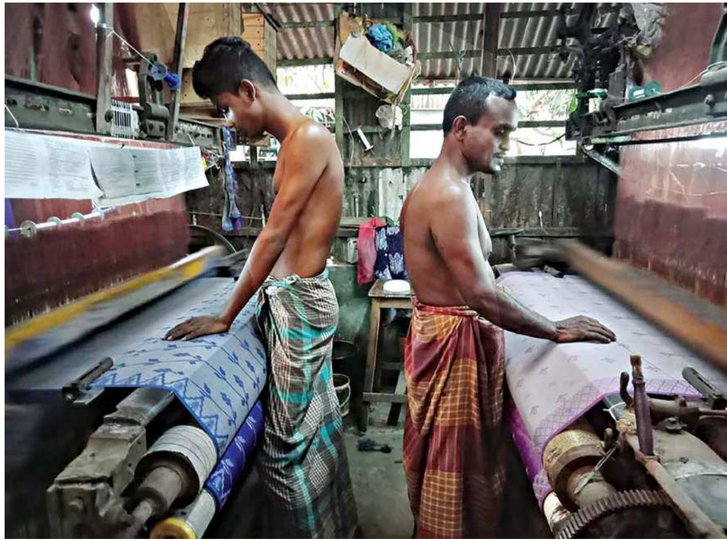
Pabna weavers say soaring prices of raw materials are eating away profits while a duty-free facility on raw material import is being misappropriated by non-beneficiaries. The photo was taken recently.