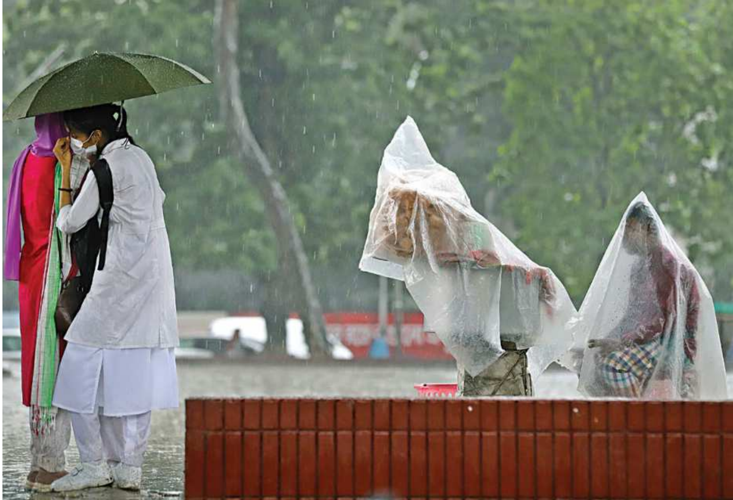
RAINY DAY TREAT... Two girls share an umbrella and wait for a phuchka seller, who has sheltered himself and his products with separate plastic covers, to reopen after the spell of driving rain at the Shahid Minar yesterday.