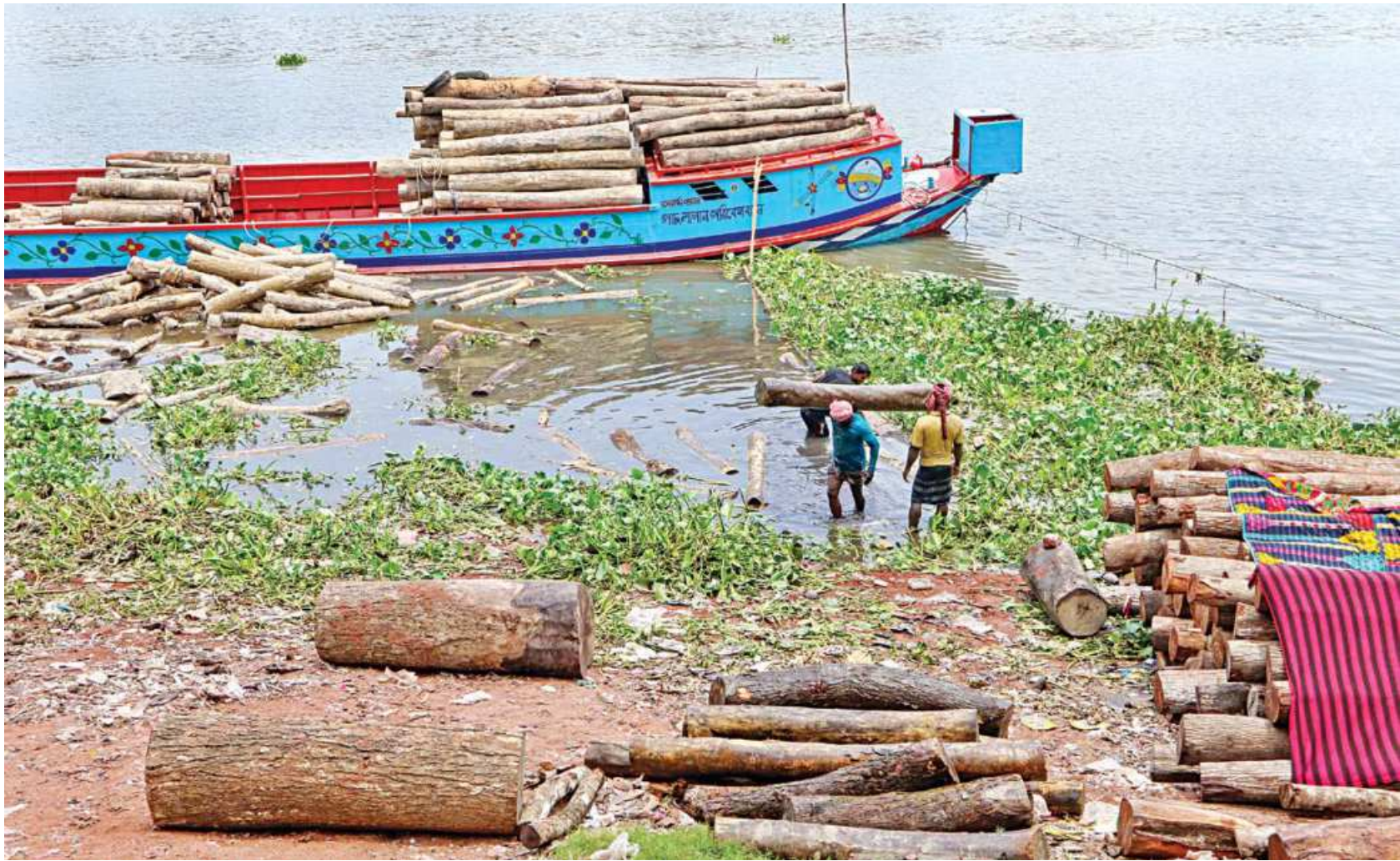
With the words “plant trees, save the environment” painted on it, a trawler carries tree trunks as saw mill owners bring in tree parts, used to make various furniture and other necessities, from from different corners of the country. The photo was taken at Buriganga river in Kamrangirchar area yesterday.