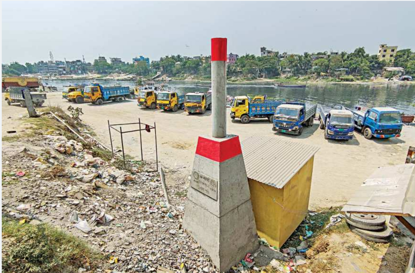
Trucks and lorries parked at the Diabari truck stand, built illegally by occupying the bank of the Turag river in the capital's Mirpur. A pillar demarcating Turag's boundaries can also be seen in the photo taken recently.