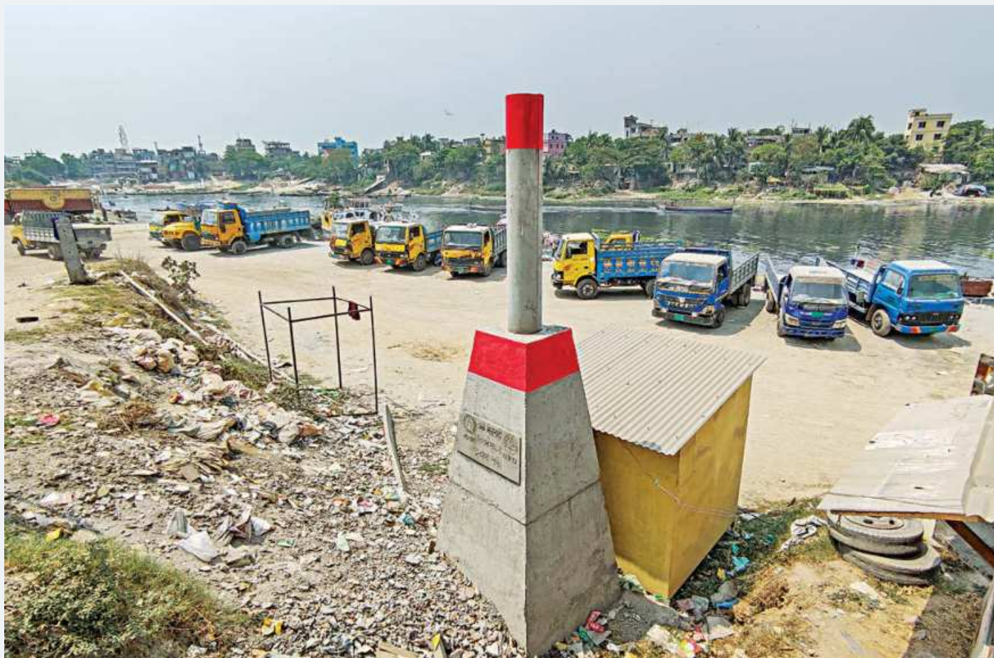
Trucks and lorries parked at the Diabari truck stand, built illegally by occupying the bank of the Turag river in the capital's Mirpur. A pillar demarcating Turag's boundaries can also be seen in the photo taken recently.