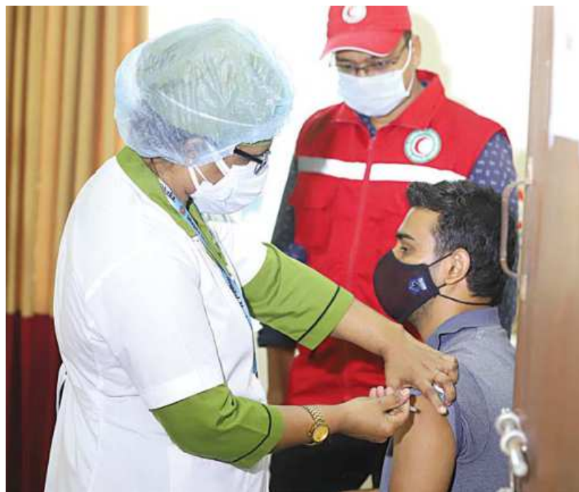
A medical college student gets a jab at Mugda Medical College and Hospital in the capital on Saturday when the nationwide vaccination campaign against Covid-19 resumed after a two month break.