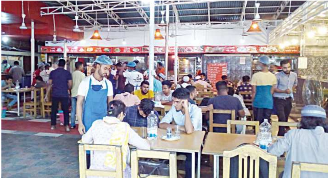
After staying closed for months on end for the Covid-19 pandemic, restaurants have been permitted to open, albeit through maintaining health safety protocols. However, people crowding such places are apparently oblivious of the regulation. The photo was taken at Panshi Restaurant in Sylhet city's East Zindabazar area yesterday afternoon.

Changing lifestyle, increasing mobility of people key factors