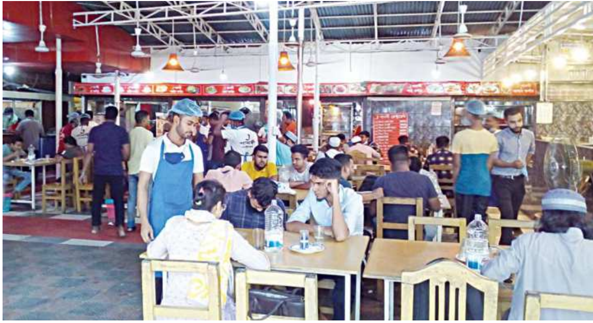
After staying closed for months on end for the Covid-19 pandemic, restaurants have been permitted to open, albeit through maintaining health safety protocols. However, people crowding such places are apparently oblivious of the regulation. The photo was taken at Panshi Restaurant in Sylhet city's East Zindabazar area yesterday afternoon.

Changing lifestyle, increasing mobility of people key factors