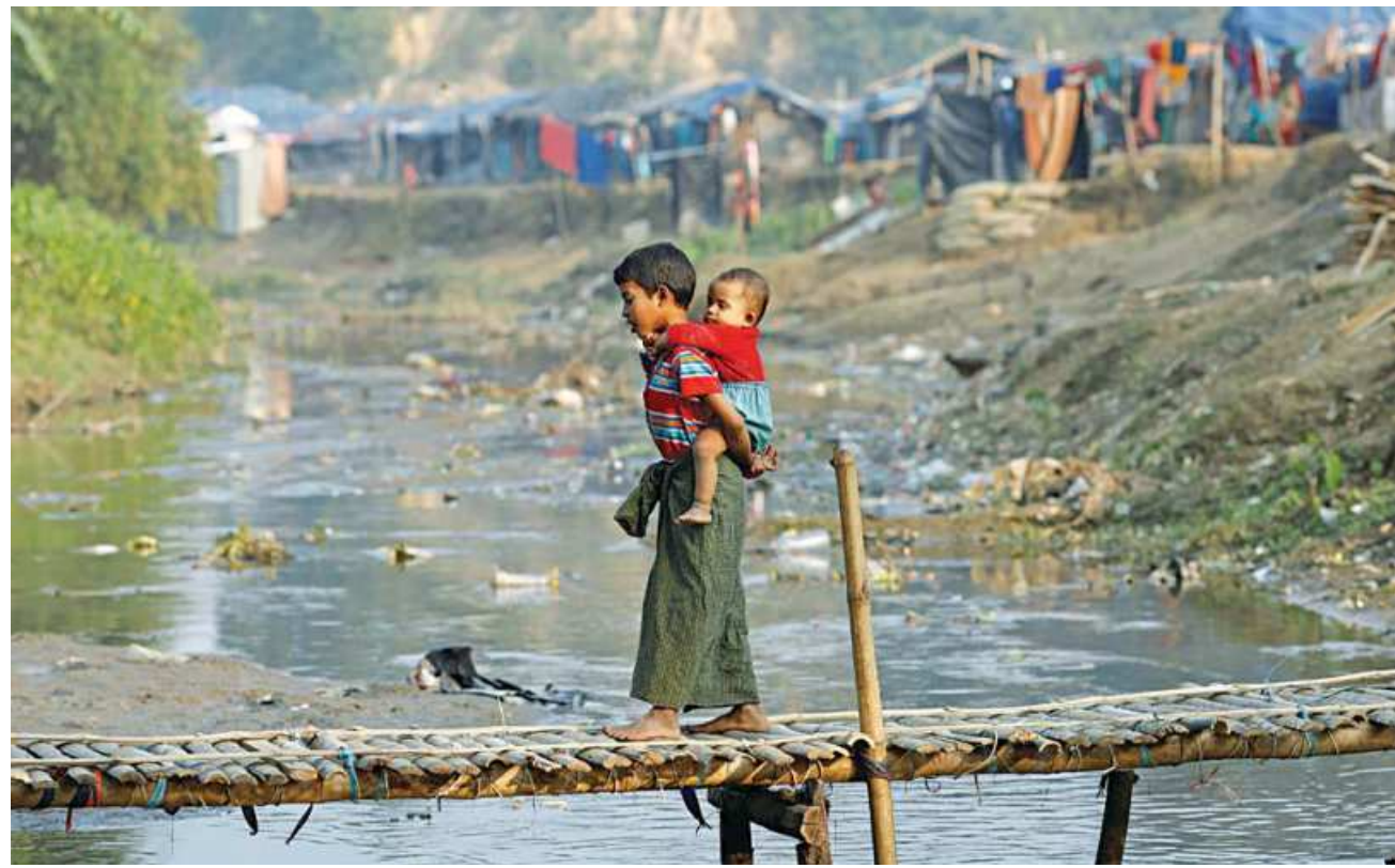
Two Rohingya refugee children at the Bangladesh-Myanmar border near Cox's Bazar, taken on January 12, 2018.

One way to rise above these assumptions is if we could view a nation-state as a refugee-generating scheme. Every state or nation-making process is built on the binary of