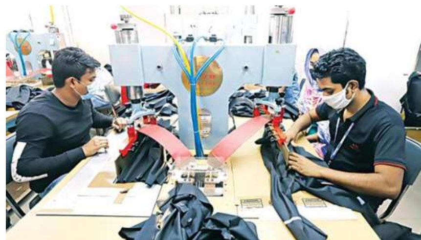
Could and should we be doing things differently to maximise return on donor investment?

It has been recognised for years that there is an urgent need for more support in areas such as social compliance, negotiation skills, workers' mental and physical health, and resource efficiency. How can we better coordinate funding streams to direct resources to areas such as these?