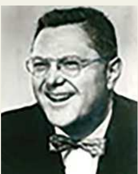
SAM LEVENSON (1911—1980) American humorist & writer

Don't watch the clock; do what it does. Keep going.