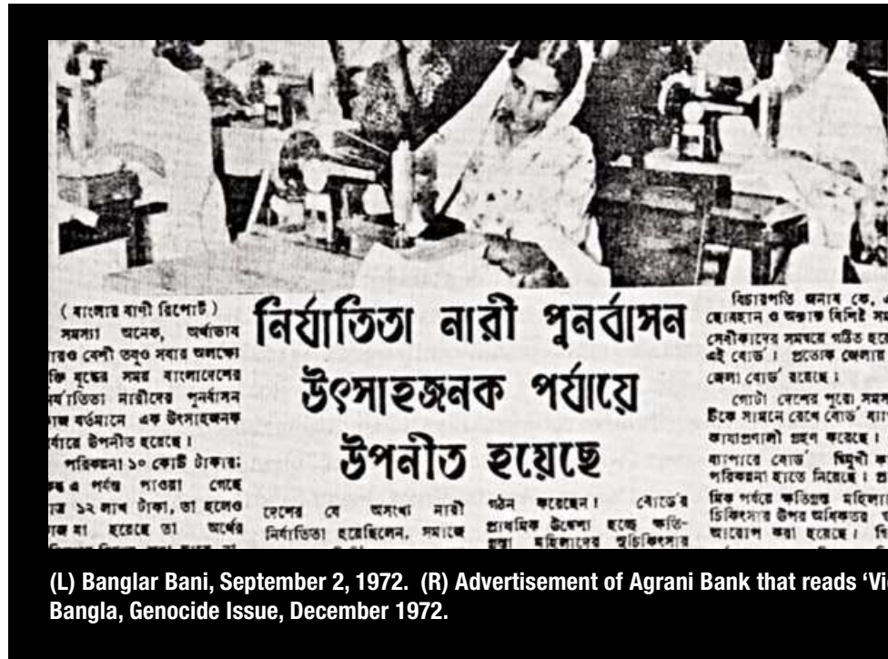
(L) Banglar Bani, September 2, 1972. (R) Advertisement of Agrani Bank that reads ‘Violated Shyamoli and her mute sobs want to say, never again, no more genocide’, Dainik Bangla, Genocide Issue, December 1972.

In 1972, the independent government of Bangladesh set up rehabilitation centres for birangonas, which undertook abortion, put their children up for international adoption, arranged their marriages, trained them in vocational skills, and often ensured them government jobs. Wartime rapes were widely reported in the press from December 1971 until the middle of 1973, after which it was relegated to oblivion in government and journalistic consciousness for 15 years, re-emerging once again in the 1990s. (The issue of wartime rape, however, remained on the