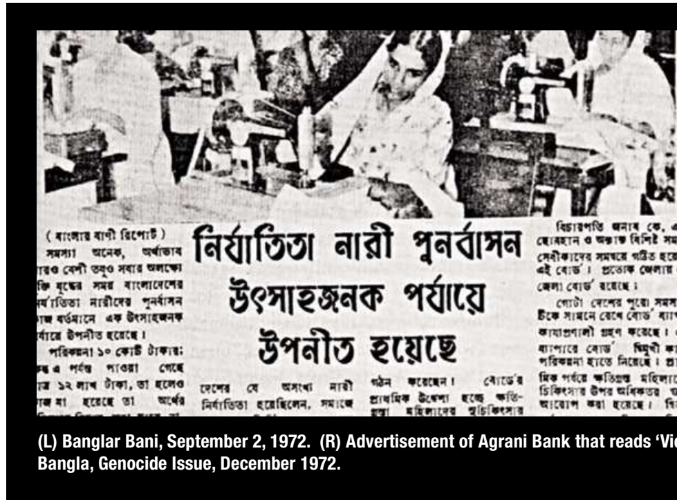
(L) Banglar Bani, September 2, 1972. (R) Advertisement of Agrani Bank that reads ‘Violated Shyamoli and her mute sobs want to say, never again, no more genocide’, Dainik Bangla, Genocide Issue, December 1972.

In 1972, the independent government of Bangladesh set up rehabilitation centres for birangonas, which undertook abortion, put their children up for international adoption, arranged their marriages, trained them in vocational skills, and often ensured them government jobs. Wartime rapes were widely reported in the press from December 1971 until the middle of 1973, after which it was relegated to oblivion in government and journalistic consciousness for 15 years, re-emerging once again in the 1990s. (The issue of wartime rape, however, remained on the