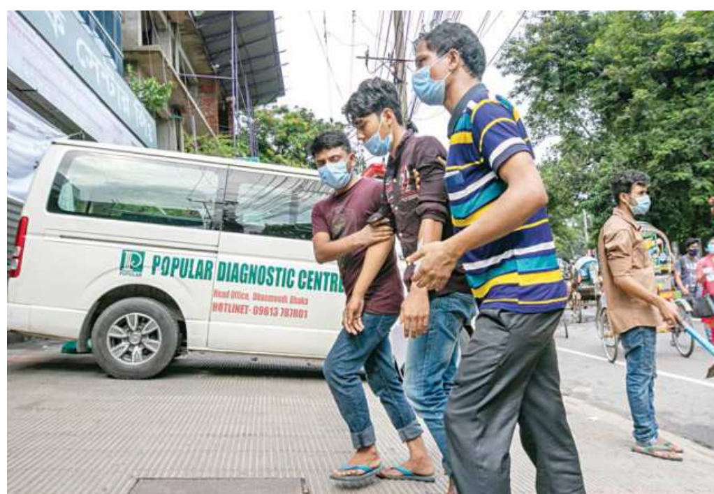
Finance Minister AHM Mustafa Kamal has offered a tax break to ensure better healthcare facilities and decentralise medical services.