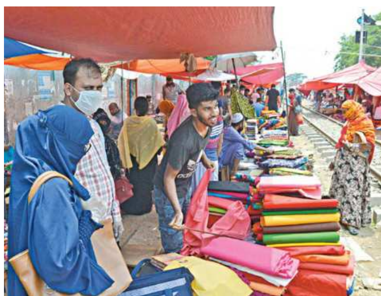
A glimpse of cloth retailers trying to attract customers. Wholesale and retail trades account for 14 per cent of gross domestic product. Photo was taken from Bogura.