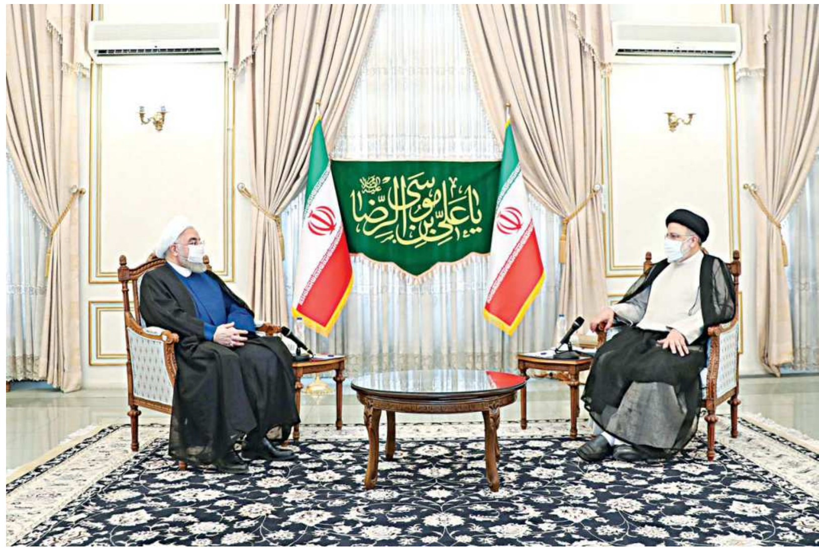
Iran's outgoing President Hassan Rouhani meets with Iran's President-elect Ebrahim Raisi in Tehran, Iran, yesterday. Ultraconservative cleric Raisi was elected president with just under 62 percent of the vote, according to figures released Saturday by Interior Minister Abdolreza Rahmani Fazli.