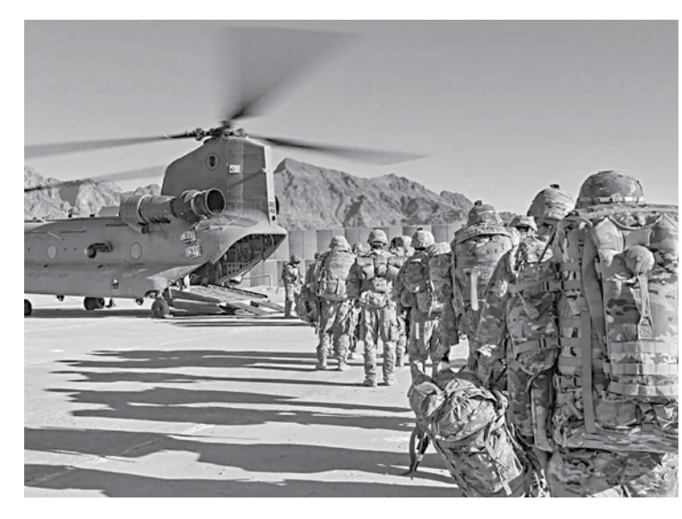
US soldiers load onto a Chinook helicopter to head out on a mission in Afghanistan.

Although officially withdrawing, the Americans will keep at least a thousand troops and some CIA officers on the ground to supervise Afghan National Army operations and gather intel. We are yet to see how it will pursue mining