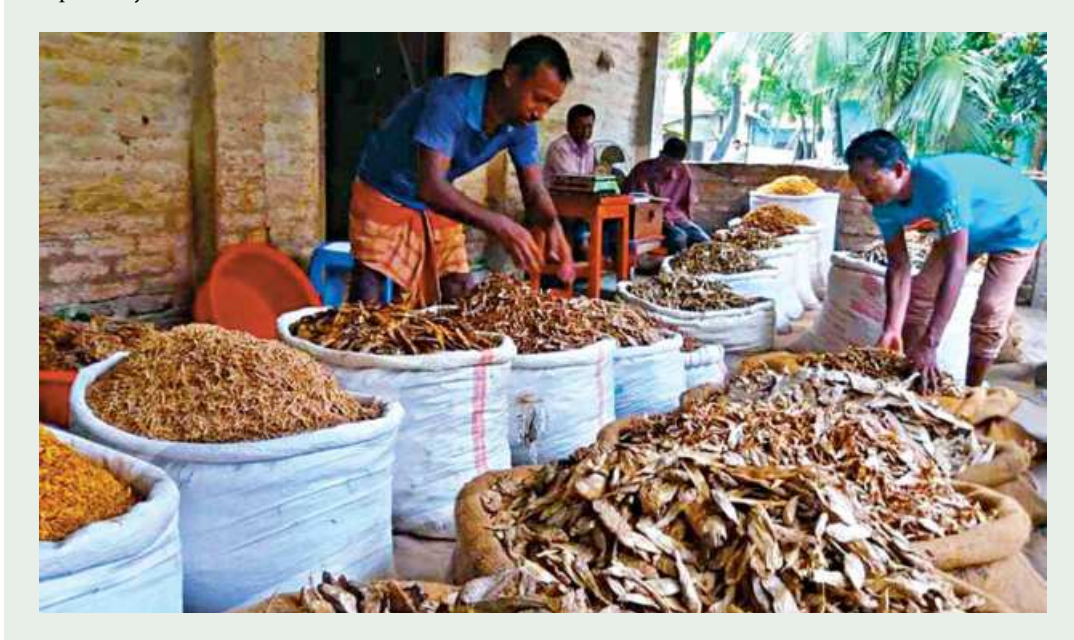
Traders at Lalmonirhat Sadar's Teesta Bazar passing their times idly, sorting again dried fish that have been sorted before. Despite a good fishing season, they are still counting losses due to the lack of customers.