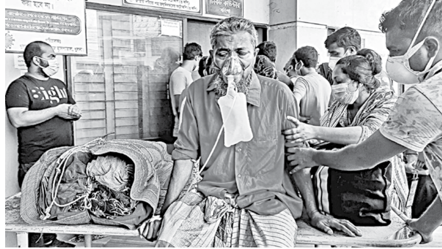
The deadly surge of Covid-19 in 2021 makes a regionally-coordinated, evidence-driven strategy even more critical.

in a cohort of 350,000 individuals across 600 villages. A combination of free mask distribution, information, reinforcement in public spaces, and role modelling by community leaders lead to large, sustained increases in mask usage that persisted beyond the period of active intervention. BRAC is implementing the model to reach 81 million people across Bangladesh. The team is now partnering with