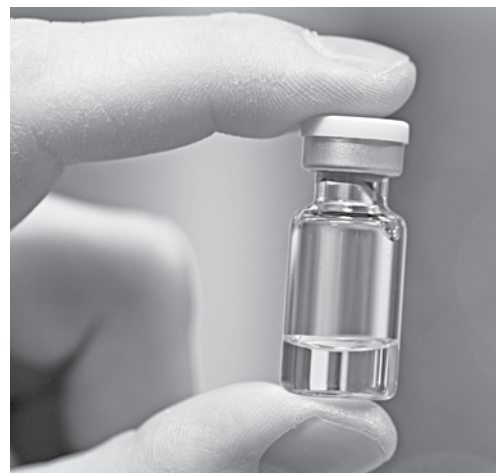
'The recent increase in supplies and the Global Commission's vaccine countdown indicate that what we need is well within reach.'

Let's look at the numbers. The world's population is 7.9 billion, an estimated 5.85 billion of whom are adults (74 percent). If the goal is an immunisation rate of 80 percent, 4.7 billion will need shots, which on a two-dose vaccine regimen means 9.4 billion doses. As of June 11, 2021, Our World in Data reports that more than 2.3 billion doses have already been administered worldwide, leaving just over seven billion doses. Divide that by a mid-