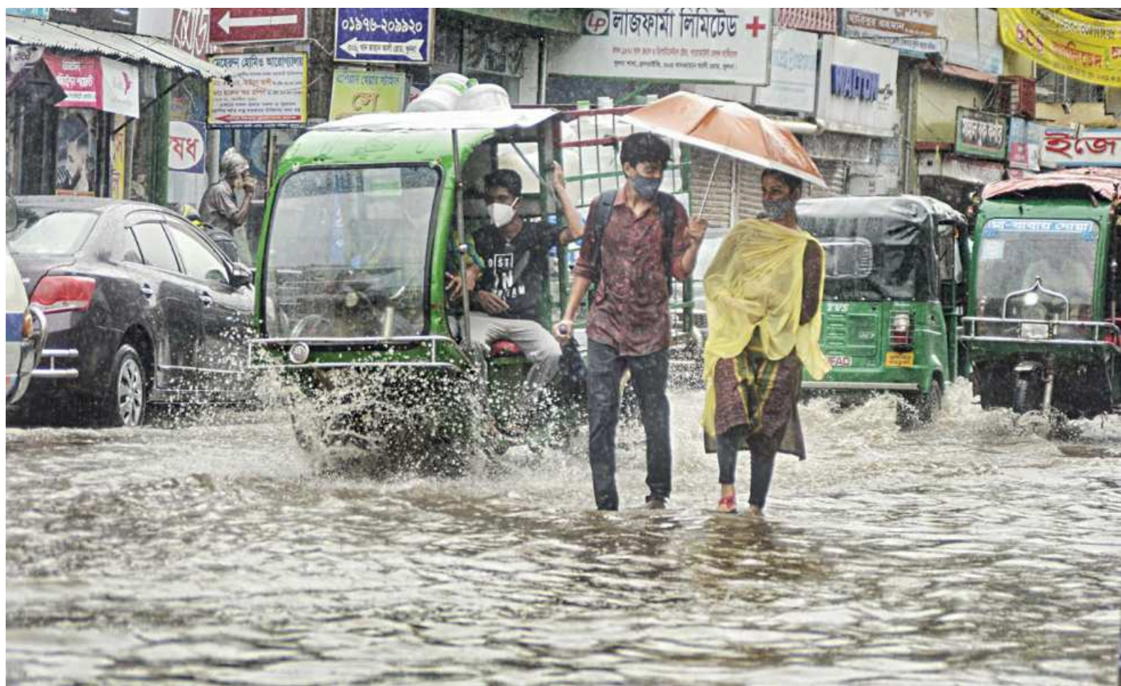
Two youths share an umbrella as they wade through ankle-deep water and splashes from moving vehicles in Khulna city's Khan Jahan Ali Road yesterday. After heavy rainfall, parts of the city, including some of its major intersections got flooded, causing trouble for vehicles and pedestrians alike.