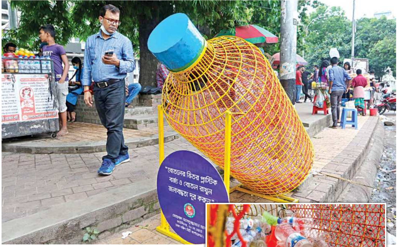
Dumping plastic waste here and there is a major reason behind obstructed drains and canals, which leads to waterlogging. In an effort to tackle this problem in the capital, Dhaka South City Corporation's Ward-21 councillor has set up this bottle-shaped plastic collection point at Dhaka University's TSC area. The sign at the bottom requests passers-by to put their plastic waste inside and help put an end to waterlogging.