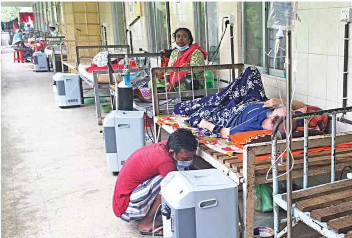
The health ministry's development spending has been low despite the government's emphasis on the sector for the second year running amid the coronavirus pandemic.

Its development spending crawls despite pandemic