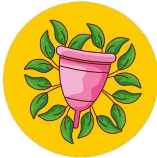
DESIGN: KAZI AKIB BIN ASAD

Sustainable period products are eco-friendly products used for menstruation management like reusable cups,