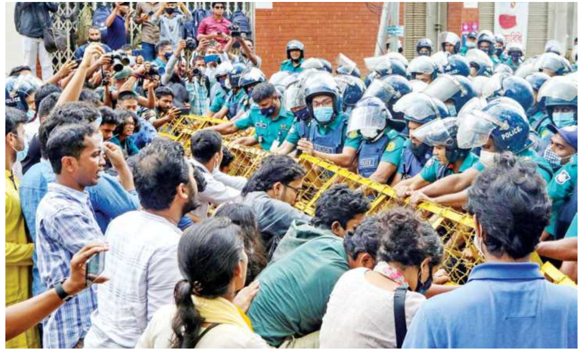
Activists of left-leaning student bodies try to break through the barricade police set up on the Secretariat Link Road yesterday afternoon. The students were marching demanding reopening of all educational institutions and they were stopped before they could reach the education ministry.