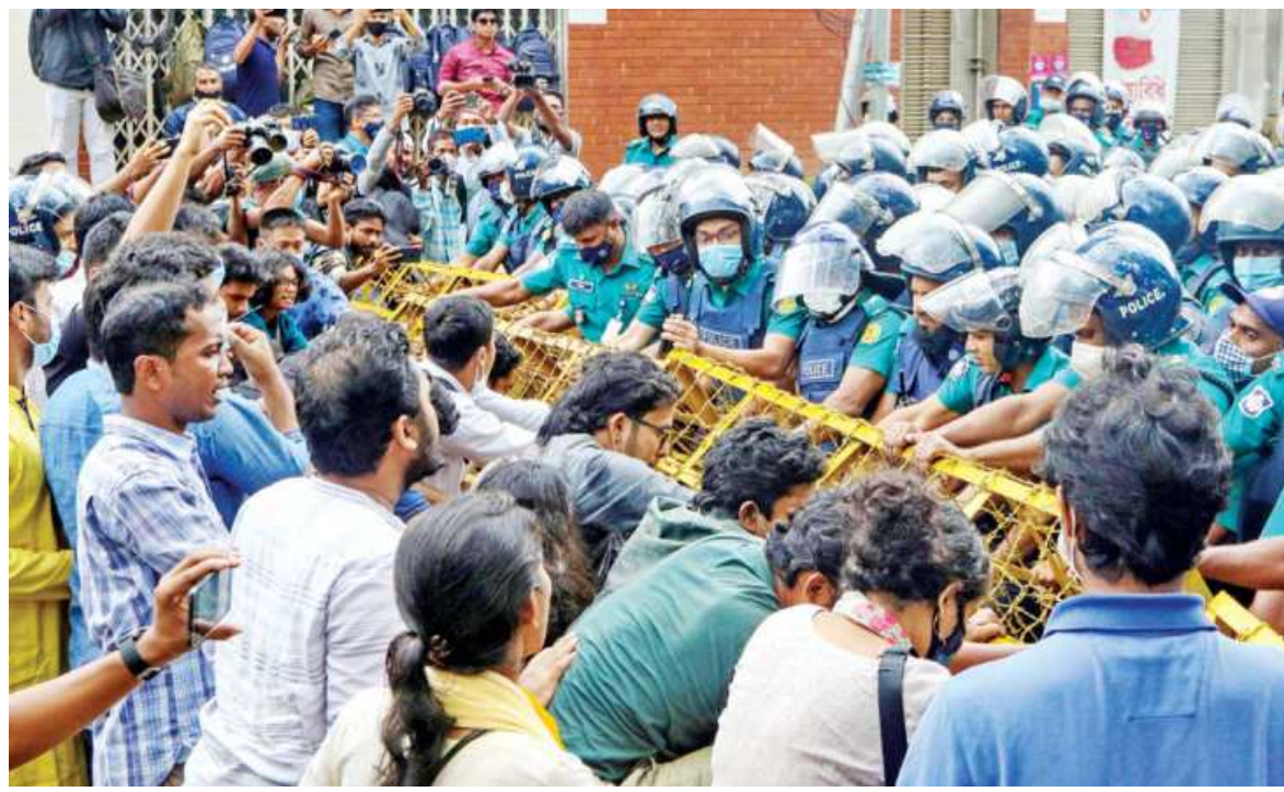
Activists of left-leaning student bodies try to break through the barricade police set up on the Secretariat Link Road yesterday afternoon. The students were marching demanding reopening of all educational institutions and they were stopped before they could reach the education ministry.

The comptroller and auditor general should immediately arrange a special audit of the management of the funds, he added.