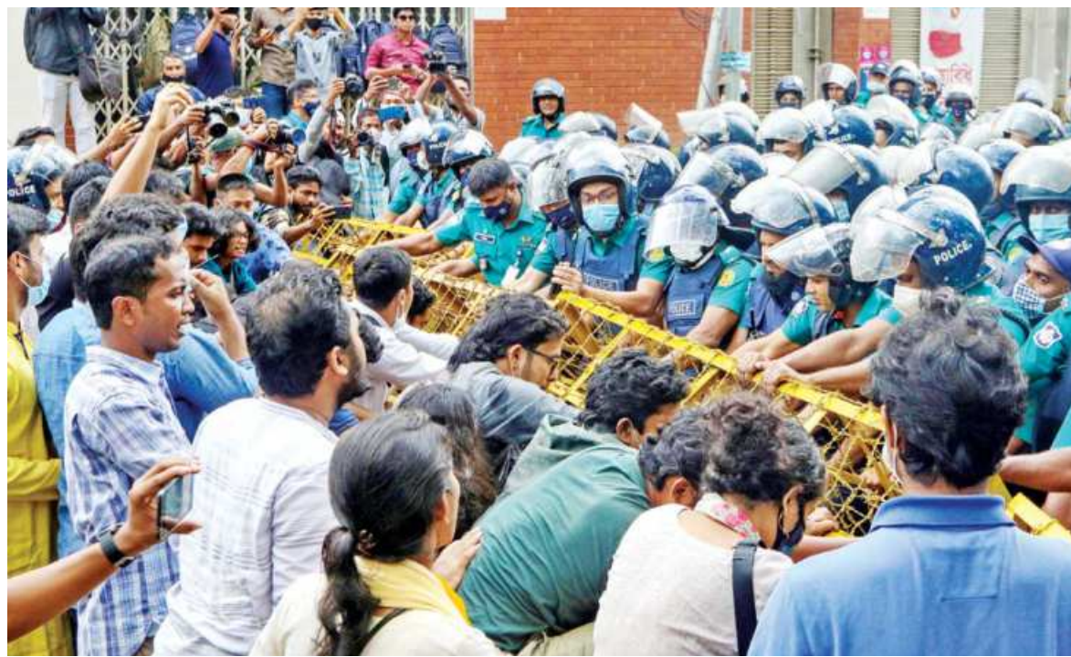
Activists of left-leaning student bodies try to break through the barricade police set up on the Secretariat Link Road yesterday afternoon. The students were marching demanding reopening of all educational institutions and they were stopped before they could reach the education ministry.

The comptroller and auditor general should immediately arrange a special audit of the management of the funds, he added.