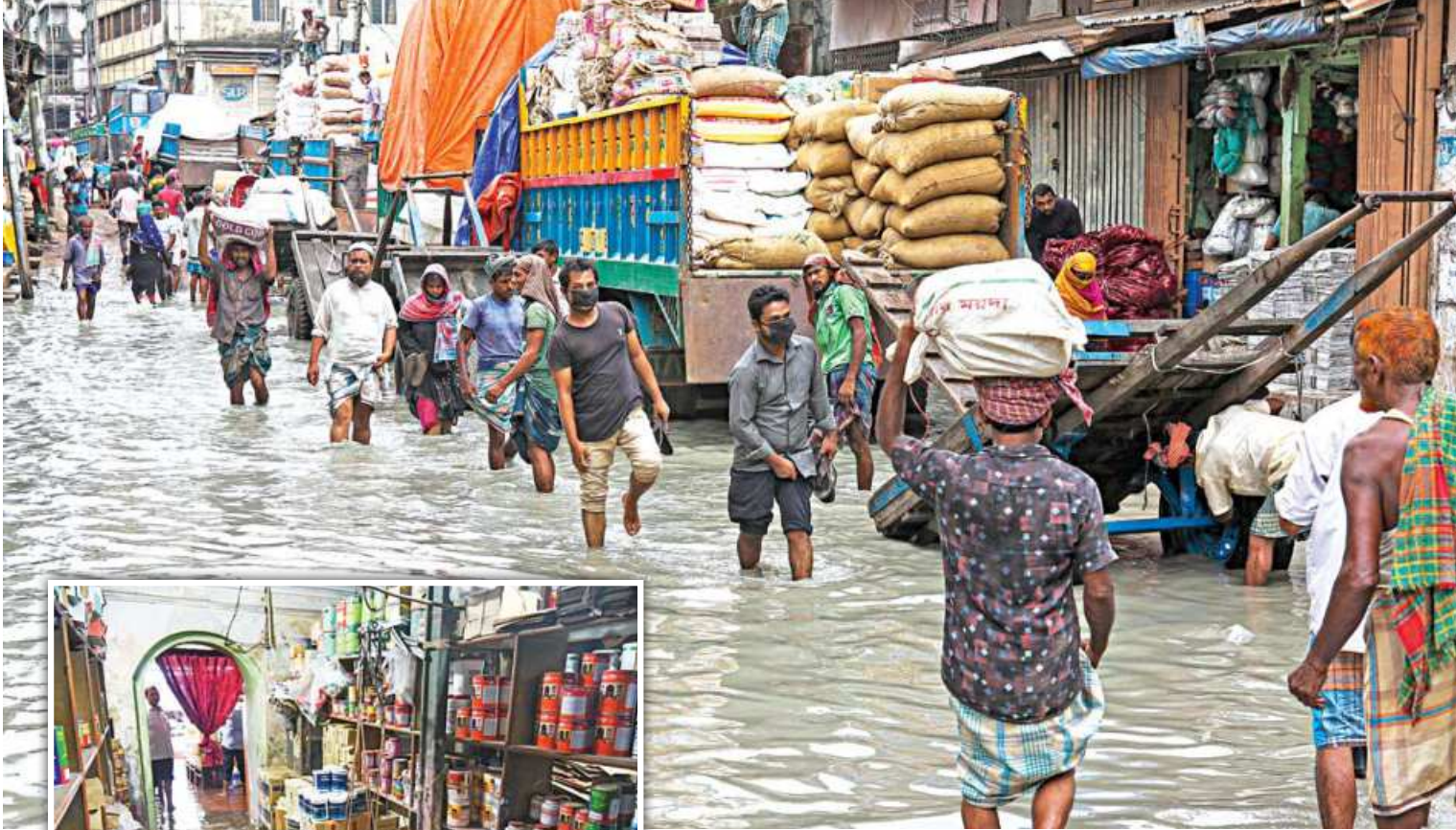
Waterlogging is a daily nuisance for traders in many areas of Chaktai-Khatunganj, the wholesale hub of essential commodities in Chattogram city, during the monsoon and tides. Delays in keeping canals freely flowing and sluice gate construction by Chattogram Development Authority are primarily to blame.

Chattogram city traders suffer as projects to solve the perennial crisis miss deadline